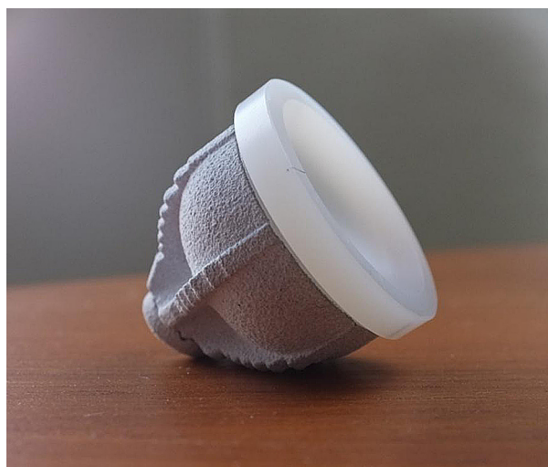
Figure 1 Lateral view of the humeral stemless cup.

The surgical procedure was performed under general anesthesia and patients received an inter-scalene block. The procedure was performed in a “beach chair” position using a deltopectoral approach. The subscapularis muscle was incised vertically in the upper third of the tendon. A cutting guide stem was introduced along the axis of the humeral shaft and a metaphyseal bone cut was performed with the help of a 150° tilt guide. A pin was centered on the bone resection using a template and a humeral reamer was centered on the resected humeral cut. The pin was removed and a guard was placed on the cut surface during the glenoid preparation time. The glenoid baseplate was inserted and fixed by screws and the glenosphere was impacted and screwed onto the baseplate. A specifically selected diameter hole was then drilled into the humerus in order to create a metaphyseal box which could receive the final