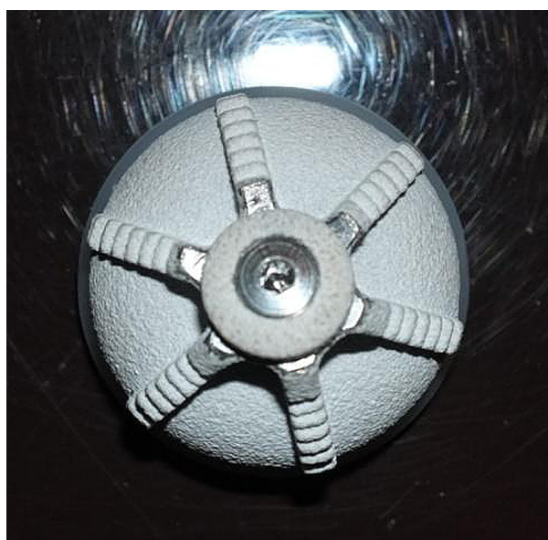
Figure 2 Posterior view of the humeral stemless cup.

corolla to allow for press-fit impaction. Trial humeral inserts were tested and the final polyethylene insert was impacted. After testing the amplitude and stability, the subscapularis muscle was reattached to the lesser tuberosity. Drains were inserted and removed at two days. In the postoperative period, patients were immobilized by a brace in abduction at 30° for 45 days and rehabilitation care was immediate (Fig. 3). Rehabilitation by a physiotherapist was started with passive and active mobilization above the plane of the orthosis. External rotation was limited to the neutral position for the first 6 weeks to protect the subscapularis muscle reinserted.